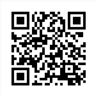
Figure 1: QR-Code to the source code on GitHub

Found an error or have a suggestion? Please open an issue on GitHub ( github.com/poijntfx/minitel ):